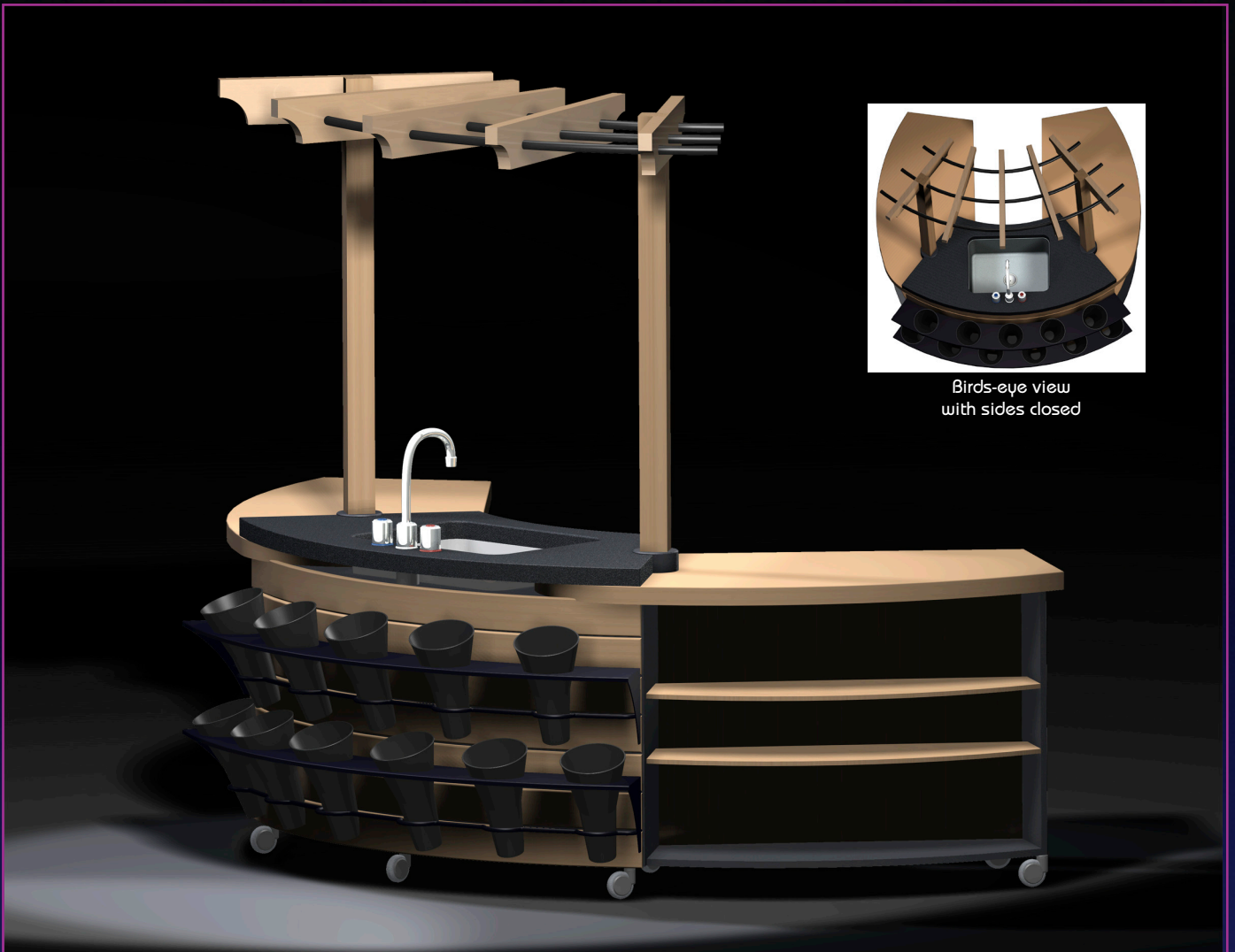
Birds-eye view with sides closed